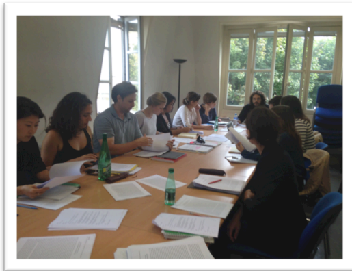
First day of the Tri-University Critical Theory Dissertation Workshop, Salle Pasteur, Ecole Normale Supérieure, Paris, September 2014.