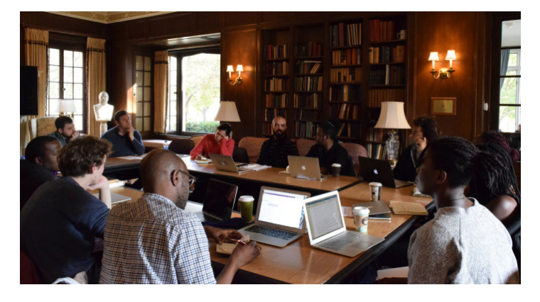
The Critical Theory Research Workshop and the After-Life of Phenomenology Workshop are sponsored or co-sponsored by the Kaplan Institute of the Humanities, and are completely student-run by members of the Critical Theory Cluster.

For more information, please contact: criticaltheory@northwestern.edu.